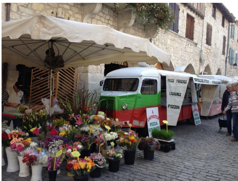
Market Day In Eymet

Events, activities, news and reports for members