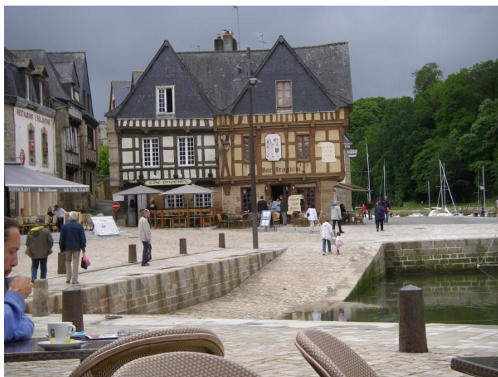
Auray

Events, activities, news and reports for members