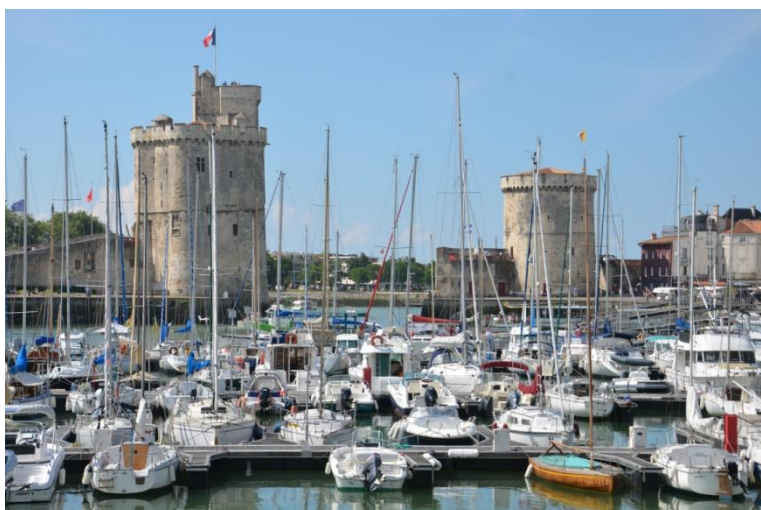
The Towers, La Rochelle

Events, activities, news and reports for members