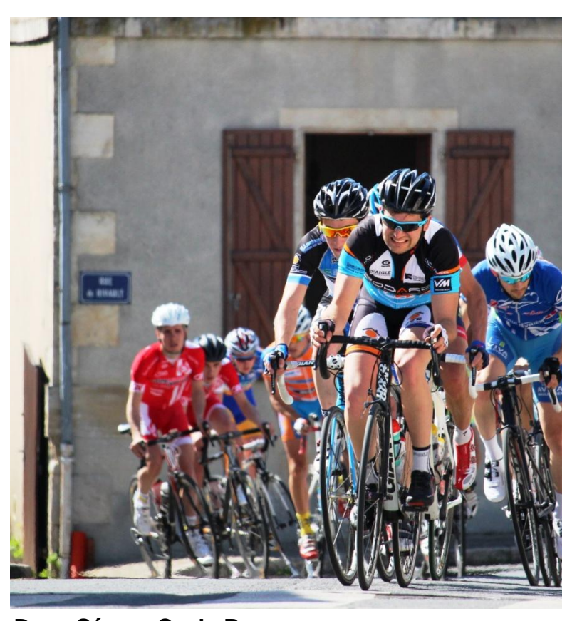
Deux Sévres Cycle Race

Events, activities, news and reports for members