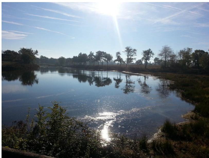
Pompaire

Events, activities, news and reports for members