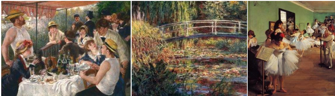
Renoir - luncheon of the boating party Monet - any number of water lilies Degas - the dancing class II

We had a full house to listen to our very own Anthea Libby giving a very different talk from the usual one on blood, sex or war. [Well not the first and third].