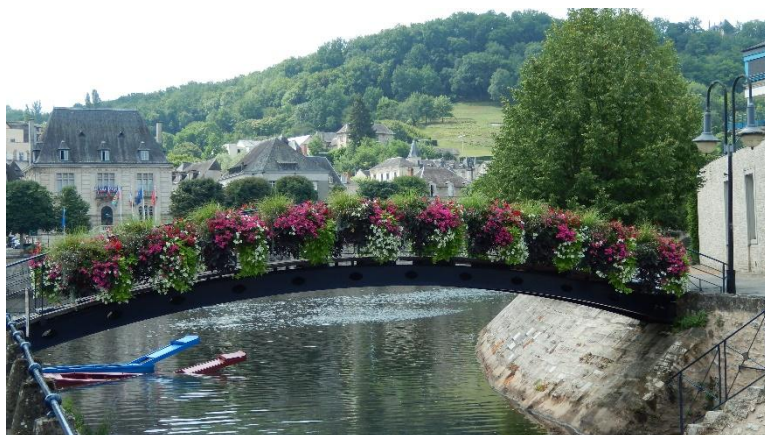
Bridge at Terrasson-Lavilledieu

Events, activities, news and reports for members