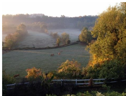
Misty Morning in Deux Sevres

Events, activities, news and reports for members