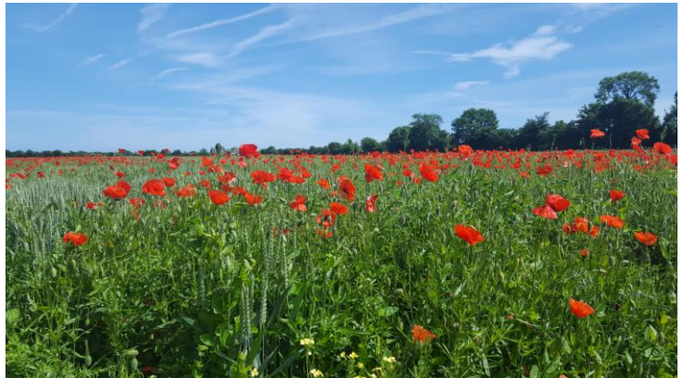
Poppies in Calvados

Events, activities, news and reports for members