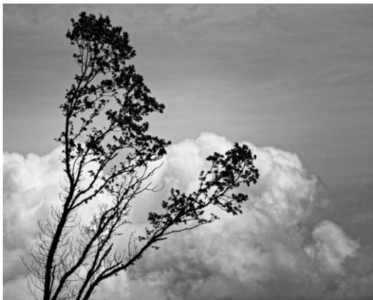
By HOWARD NEEDS