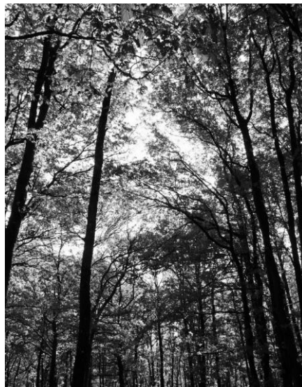
By MARTIN HUGHES

Second runner's up were Caz's tree bark, Howard's tree and Martin's lane. Next meeting will be on Monday 14 th June at 14:00 hrs – full details to follow.