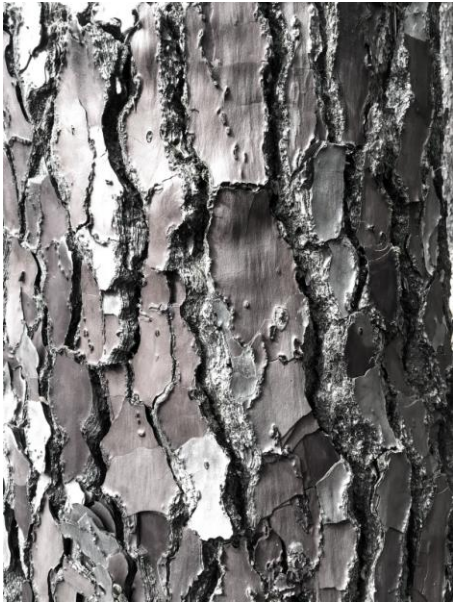
by CAZ BRAY