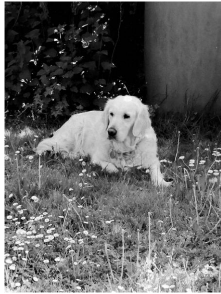
By VINNY GALLOWAY