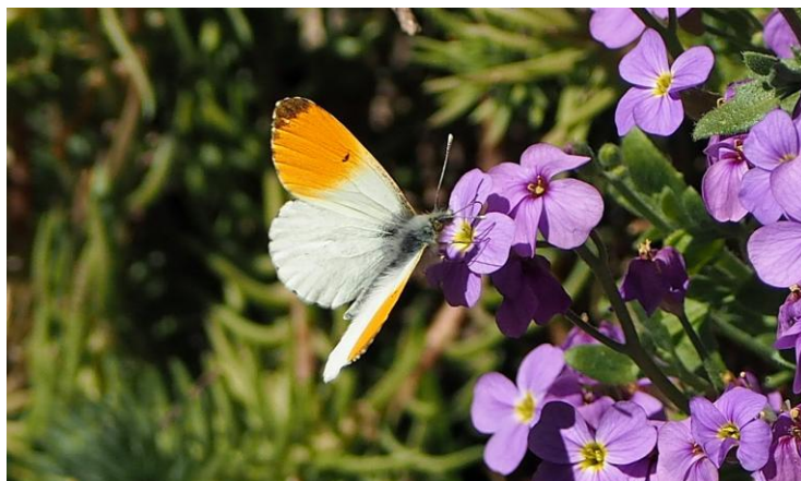
Butterfly at Perre 1

Events, activities, news and reports for members